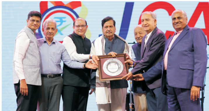
Felicitation of Guest of Honour Shri Mangal Prabhat Lodha , Hon'ble Minister of Skill Development, Government of Maharashtra

One of the most appreciated sessions of the day was the panel discussion on “Indian Economy & Wealth Creation 2047.” The discussion featured eminent experts including Gurmeet Chadha of The Complete Circle, Shri Harish Krishnan of Aditya Birla Capital Mutual Fund, and Harshad Borawake of Mirae Asset Mutual Fund. The session was expertly moderated by CA Jeendra Bhandari of MGB Advisors, resulting in insightful discussions on long-term wealth creation, economic opportunities, and India's future growth potential.