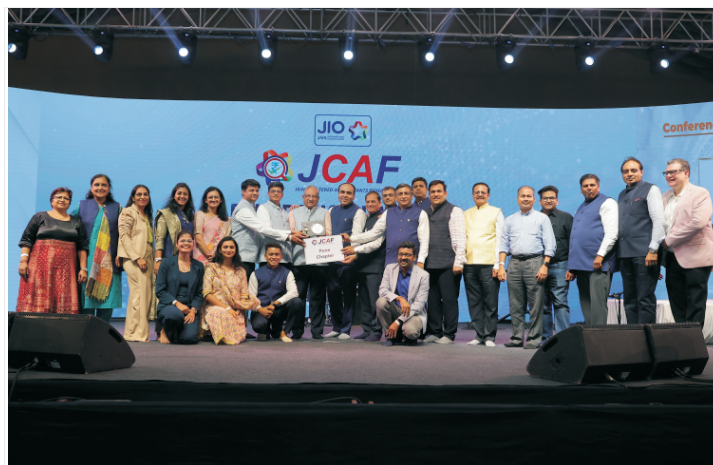
Highest Membership Growth Initiative Pune Chapter