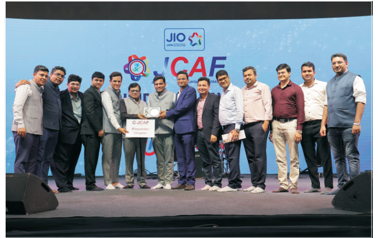
Jain Tirth Yatra Initiative Mira Bhayander Chapter