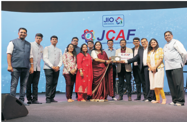
Inter-Chapter Sports Initiative North West Mumbai Chapter