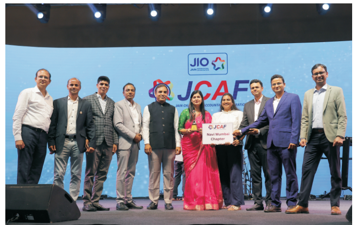
Membership Growth Initiative Navi Mumbai

जीवन मे रात कितनी भी अंधेरी क्यो न हो, लेकिन वो रात ही है, सुबह होना तय है..!!