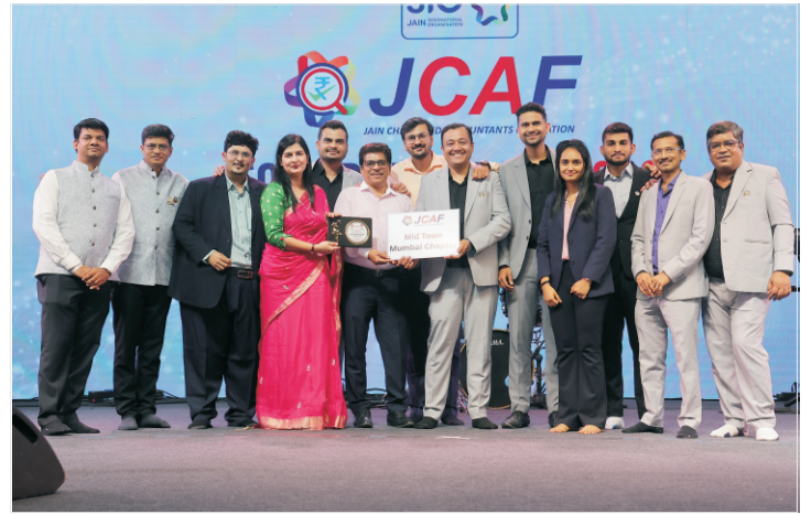
Sadhu–Sadhvi Vaiyavachha Initiative Midtown Mumbai Chapter