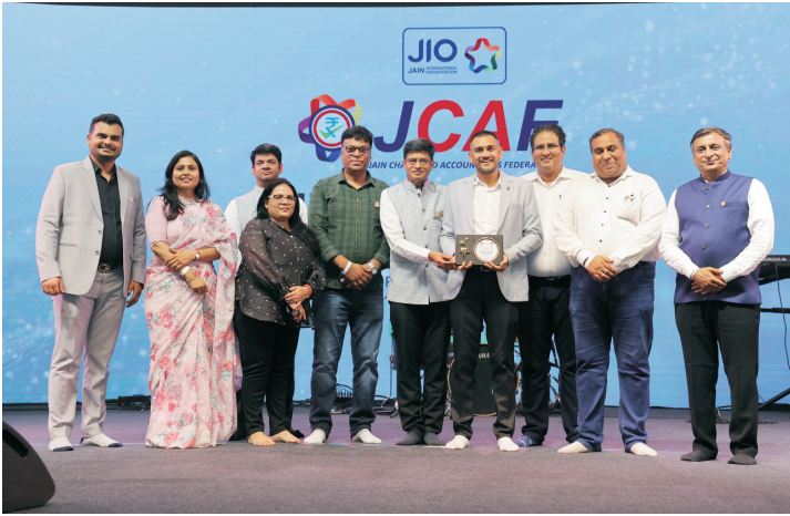
Blanket Distribution Drive Malwa Chapter