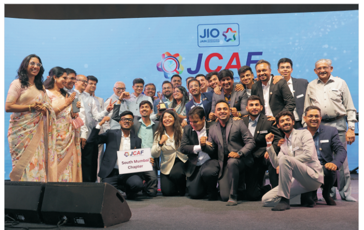
Dharmik Collection Drive South Mumbai Chapter

सहनशक्ति इतनी रखो कि तुम्हें तोड़ने वाला खुद टूट जाए!