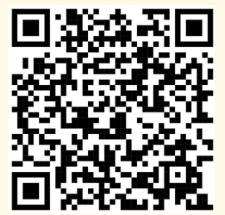
Account Edge QR Code (CA Firms)