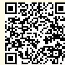
Account Edge QR Code (Students)